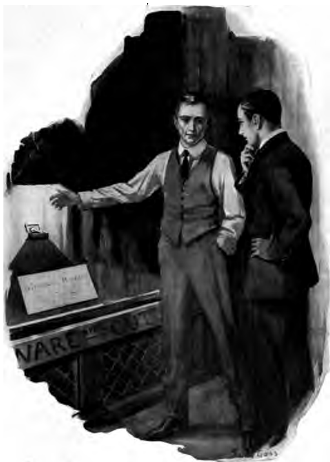
" I WAS STANDING OUTSIDE THE WINDOW "